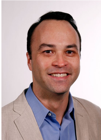
1049 x 1440 vert