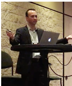
1319 x 1714 vert