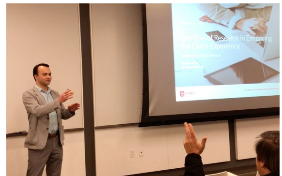
3209 x 2012 horiz