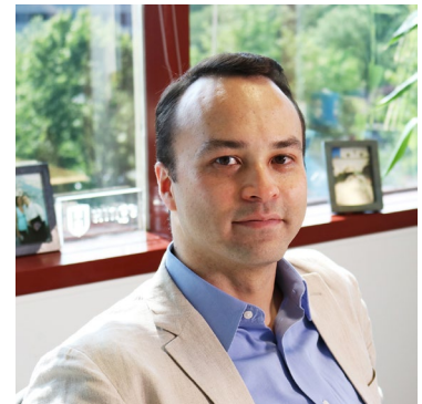
1399 x 1399 square