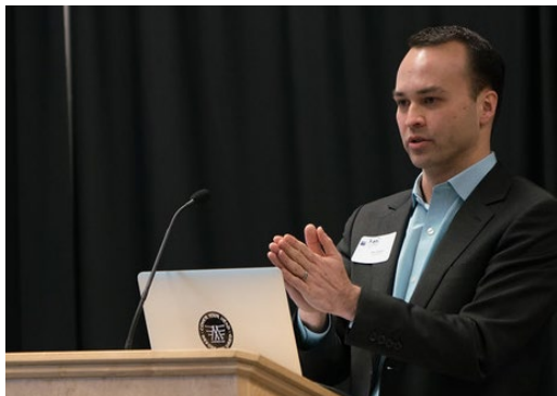
1024 x 684 horiz