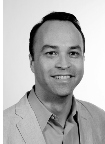
1450 x 1990 vert bw